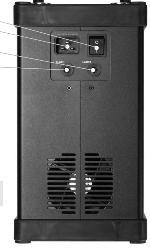
The AC Inlet, On/Off Switch and Thermal Reset Buttons are mounted on the rear panel.